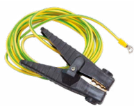
1 earth clamp