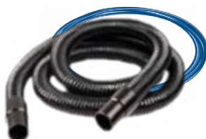
1 hose 3 m | \varnothing 29 mm