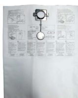
1 dust bag (PN. 058880 - 5 bags)