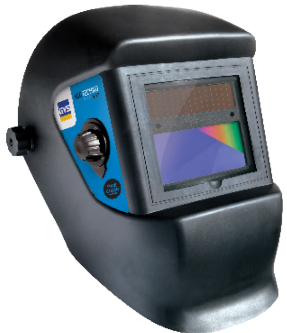
Delivered with a headband