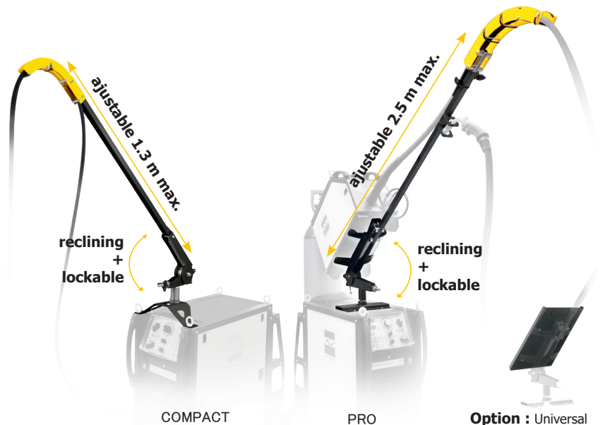
Option : Universal support for mig lift pro: can use any wire feeder ref.046436