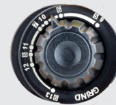
Shade 5&gt;13 and grinding mode