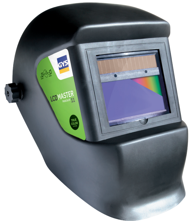
Delivered with headband