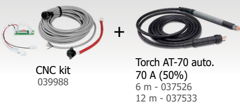
CNC kit 039988