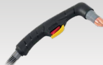
Torch MT-70 manual 70 A (50%) 6 m - 037502 12 m - 037519