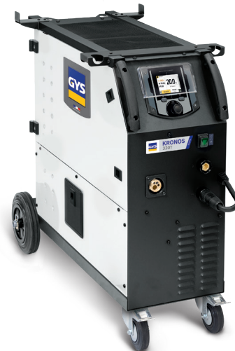
Supplied without accessories