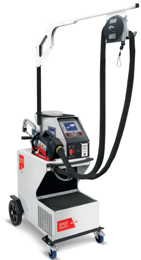
GYSPOT PTI PREMIUM PRO (400 V)