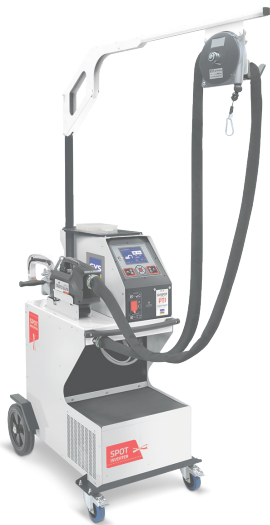
GYSPOT PTI-S7 (400 V)