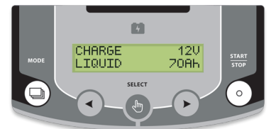
Simple-to-use HMI available in 22 languages