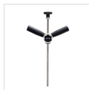
Central pulling rod Ref. 059399