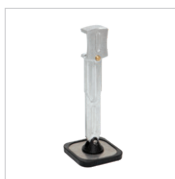
Single long foot Ref. 059337