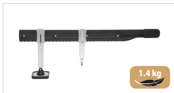
Single foot levelling bar premium Ref. 059290