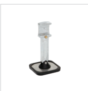
Single short foot Ref. 059320