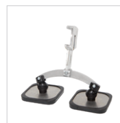
Double padded short foot Ref. 059344 Ref : 059351 (x2)