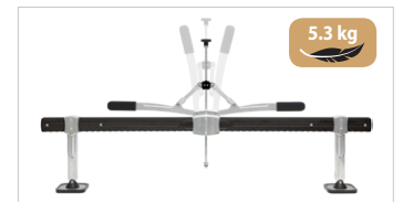
Premium levelling bar - 1200 mm Ref. 059313