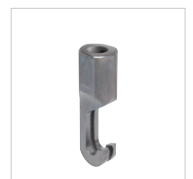
Hook 2 teeth Ref. 059382 Hook 3 teeth Ref. 059658