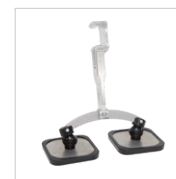
Double padded long foot Ref. 059368 Ref : 059375 (x2)