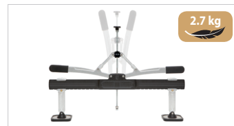
Premium levelling bar Ref. 058996