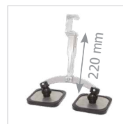
Long double foot 059375 (x2)