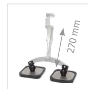
Extra-long double foot 072688 (x2)