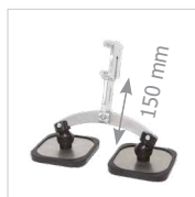
Short double foot 059351 (x2)