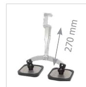
Extra-long double foot 072688 (x2)