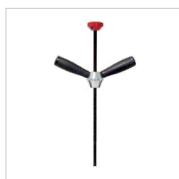
Central pulling rod 069268