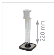
Long single foot 061293 (x2)