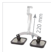
Long double foot 059375 (x2)