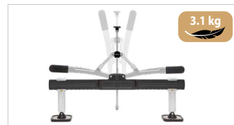
PREMIUM scissoring bar 058996