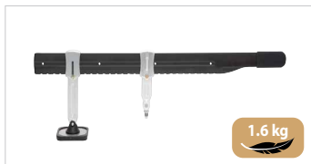
Single foot levelling bar PREMIUM 059290