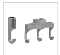
Single-tooth pull 082021 3-tooth claw 059658