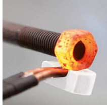
Releases rusted bolts