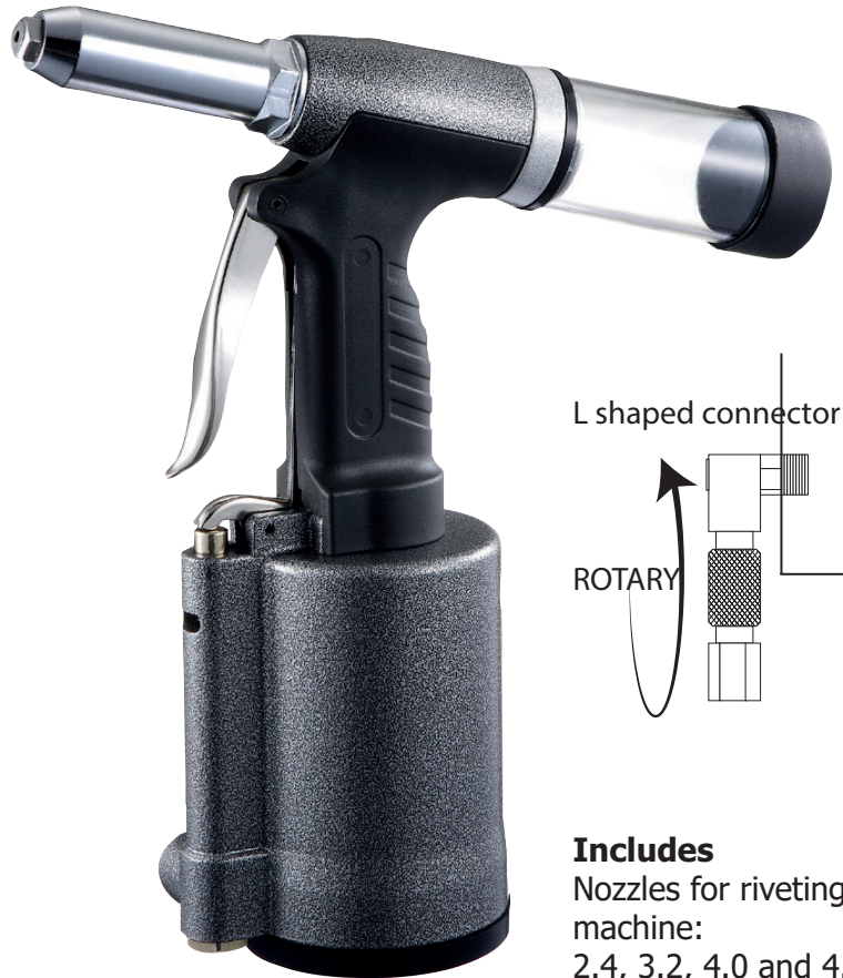
L shaped connector