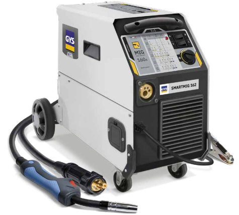
Earth Clamp and 2m EURO torch included.

Constant running fan protects unit against overheating.