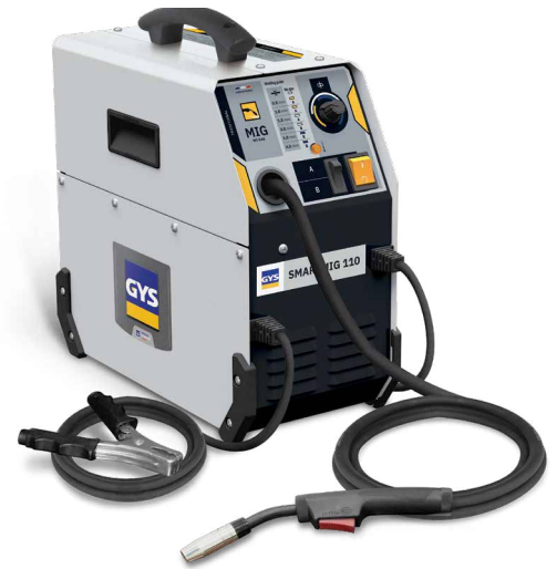
Supplied with an earth cable and a 2.2m fix torch.

1 process: NO GAZ for outdoor welding. Ø Wire 0,9 mm (kit no gas : 041240)