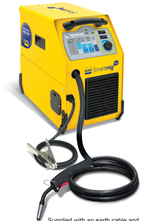
Supplied with an earth cable and a 2 m fix torch.

Constant running fan protects unit against overheating.