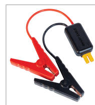
Smart jump lead